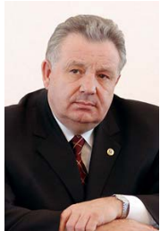
Victor Ishayev Presidential Plenipotentiary Envoy to the Russian Far East Federal District