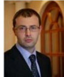
Roman Kopin Governor Chukotka Autonomous Region Russian Federation

RAPP is the only US – Russian bilateral forum partnering business and government between Eastern Russia and the Western U.S.